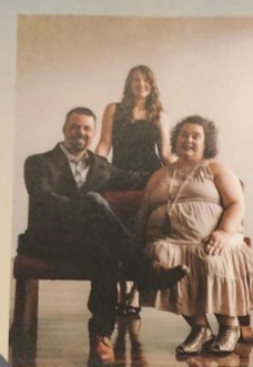
Fields of Grace