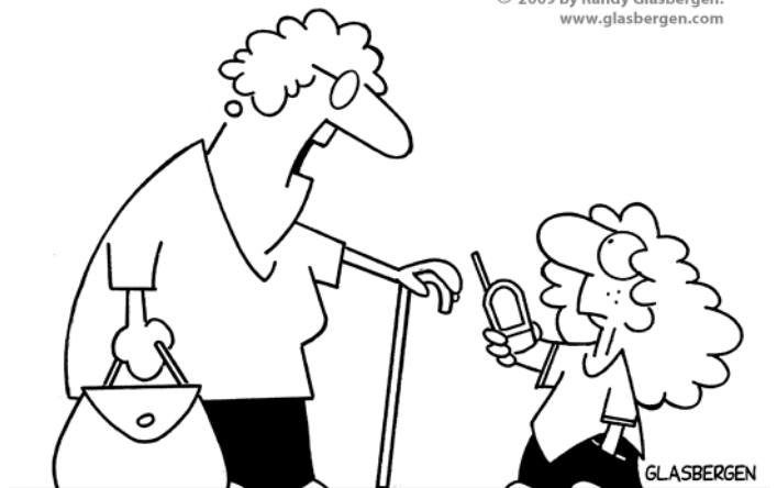
"Wireless communication is nothing new. I've been praying for 75 years!"