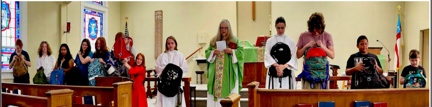
Blessing of the Backpacks is a tradition for our church family. Youth are excited to start school and share their backpacks!