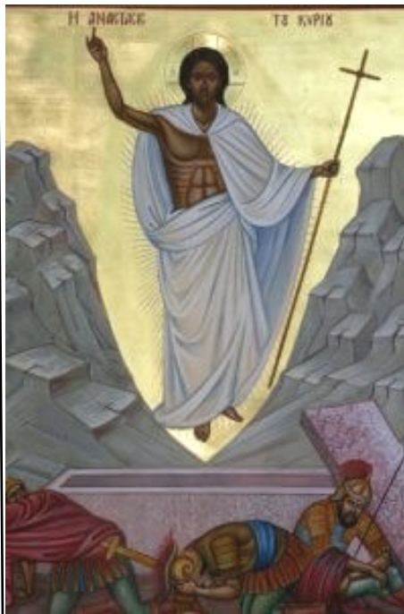
image: Church of Archangel St Michael Trypiontis. Resurrection icon. Nicosia, Cyprus.