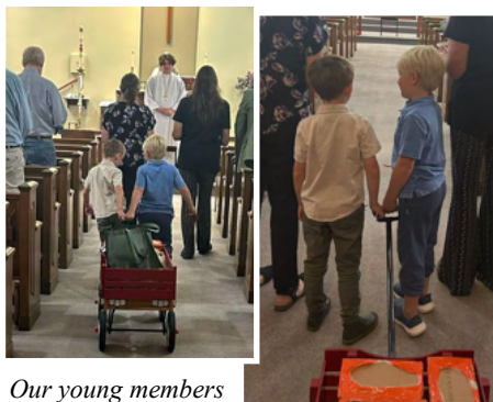
Our young members learn about service to our community with food donations to VAC.

Please note all donations in the collection plate on the 3rd Sunday of each month are designated to this fund. This supports our clergy work.